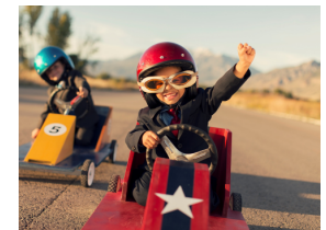
Insight Provider Specialists Platform Builder Polymath Team Leader